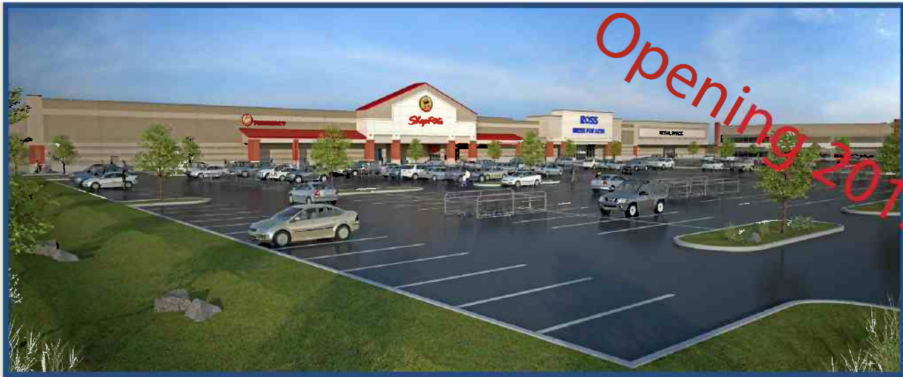
FORMER HEADQUARTERS OF TASTYKAKE BAKING COMPANY