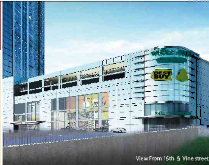
View From 16th & Vine street