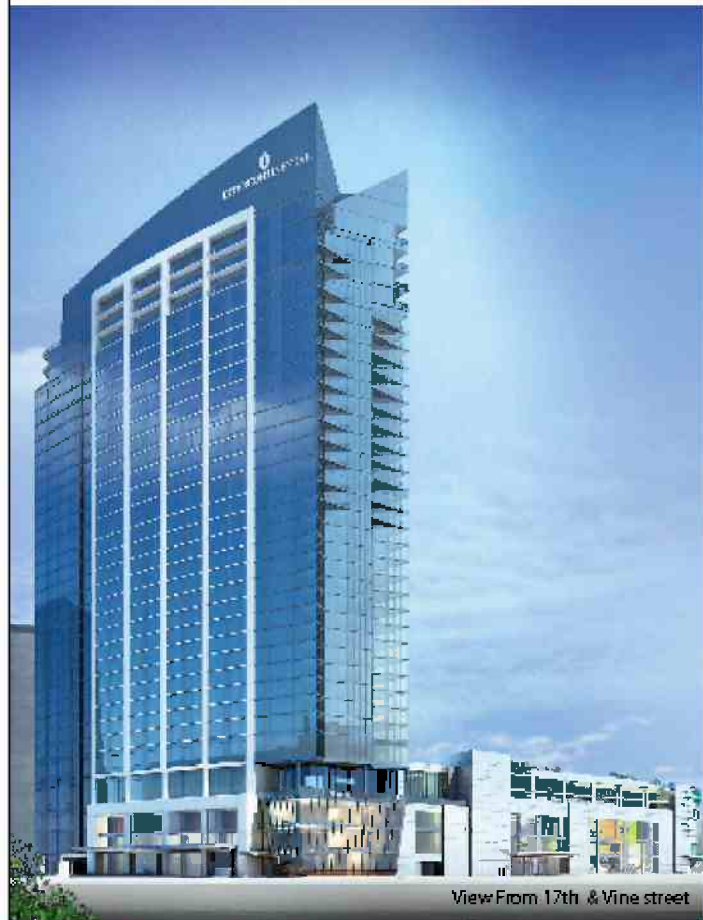
View From 17th & Vine street